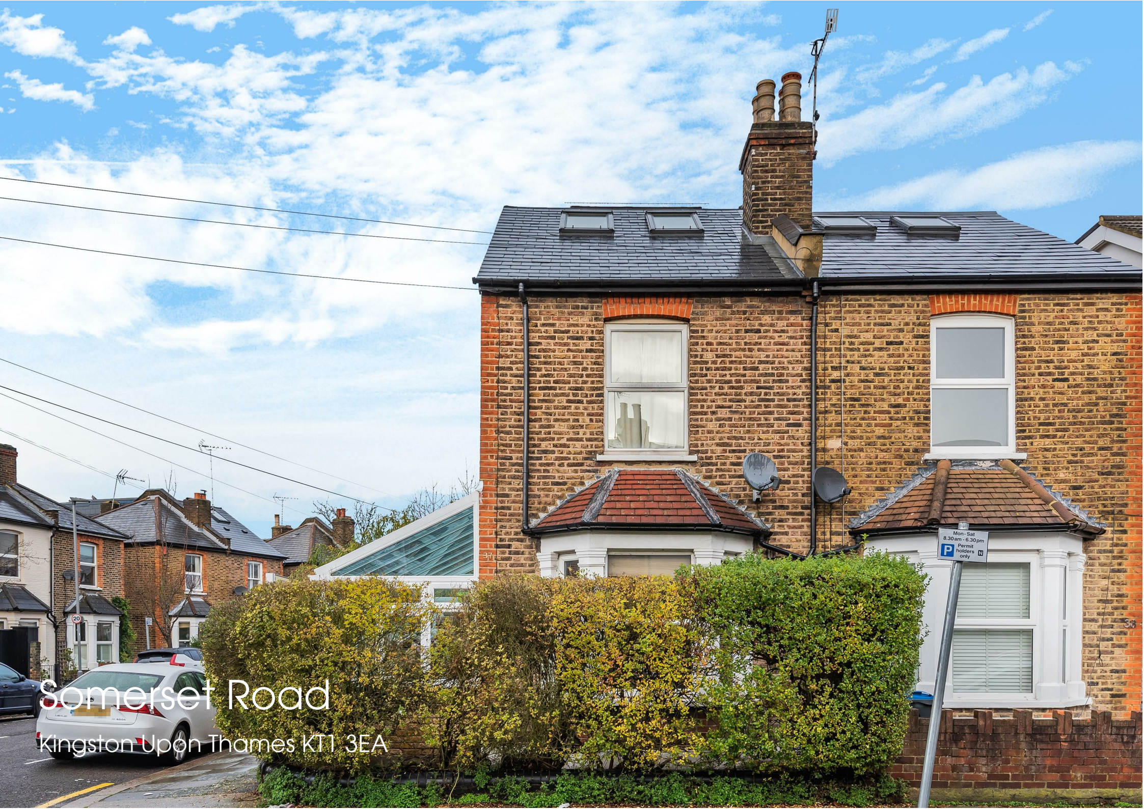
Somerset Road Kingston Upon Thames KT1 3EA